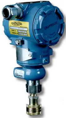
Pump Pressure Sensor

The pump pressure sensor and casing pressure sensor are directly connected to the kelly or casing. These sensors provide very rapid response time. Alternatively, Datalog can provide hydraulic sensors quick connect coupling for fast installation and Datalog can supply a hydraulic isolator if the drilling rig does not have an isolator installed. The accuracy is \pm 0.5\% , full scale is 35,000 KPa, 70,000 KPa or 140,000 KPa.